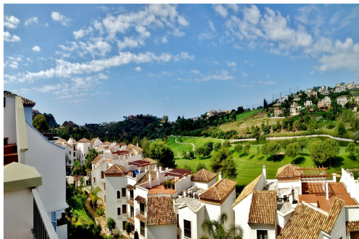
90 sq. mtrs. of rooftop solarium