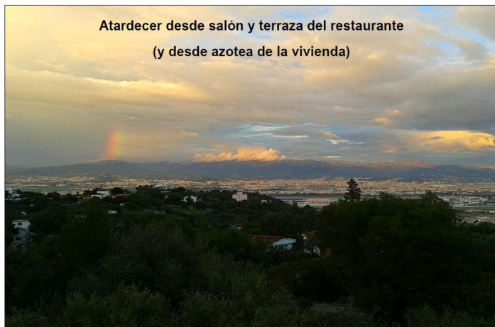
Atardecer desde salón y terraza del restaurante (y desde azotea de la vivienda)