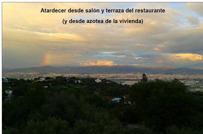
Atardecer desde salón y terraza del restaurante (y desde azotea de la vivienda)