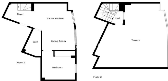
Floor Plan Created By Cubicasa App. Measurements Deemed Highly Reliable But Not Guaranteed.